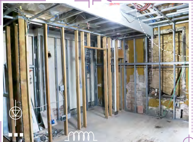
“2nd Floor Progress”