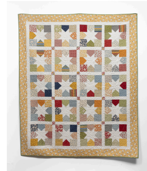
Kathryn Prentice Friendship Quilt

The deadline to apply is June 30th . Applicants may submit up to three pieces for consideration (not all will be selected). Selected pieces must be prepared with hardware for installation. If you are interested in curating the show, please complete the curator application by May 31st .