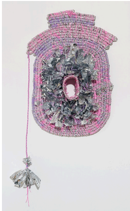
José Santiago Pérez Second Portal (Mother's garden a generation from now)

Below are some examples of artworks aligned with the theme: