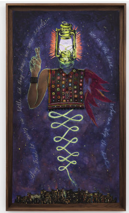
Chitra Ganesh we are the dust