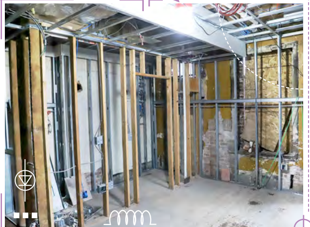
“2nd Floor Progress”